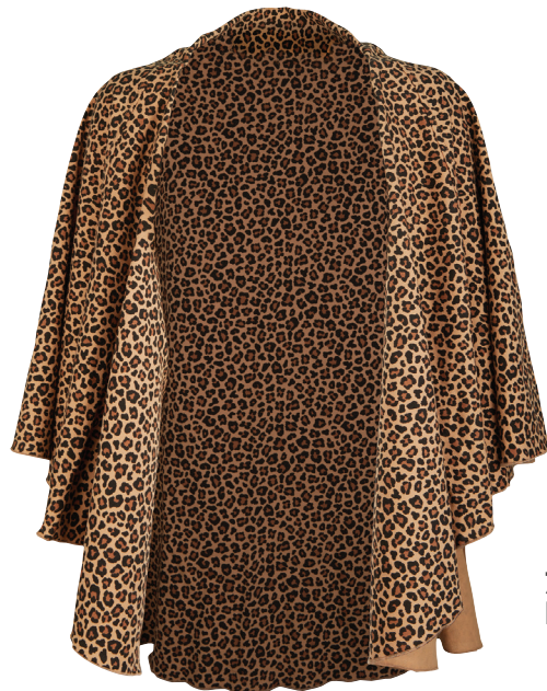
701 LEOPARD PRINT