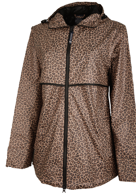
701 LEOPARD PRINT