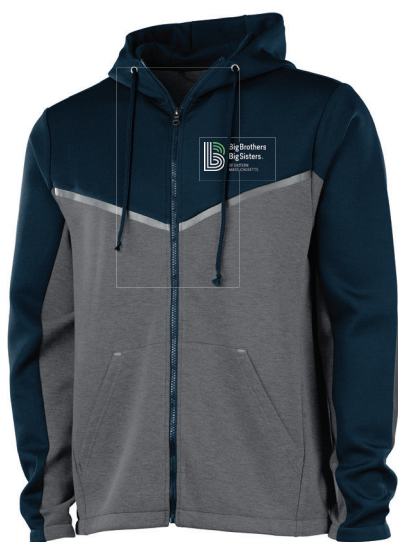
SEAPORT FULL ZIP HOODIE WOMEN'S 5091 | MEN'S 9091

Helping children reach their potential with every purchase of the Seaport Full Zip Hoodie.