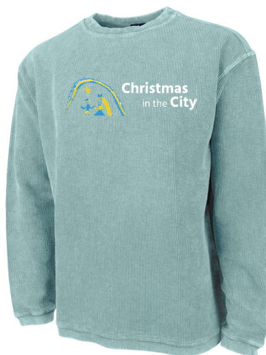
CAMDEN CREW NECK SWEATSHIRT ADULT 9930

Bringing comfort and joy to children and families in need with every purchase of the Camden Crew.