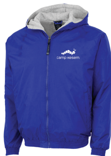
PERFORMER JACKET CHILDREN'S 7921 | YOUTH 8921

Supporting children impacted by a parent's cancer with every purchase of the Performer Jacket.