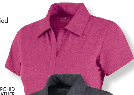
057 ORCHID HEATHER

057 Orchid Heather, 208 Graphite Heather, 240 Navy Heather, 176 Red Heather