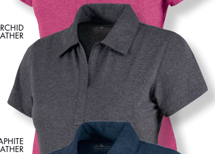
208 GRAPHITE HEATHER