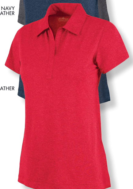
176 RED HEATHER