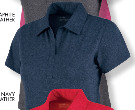
240 NAVY HEATHER